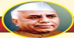
Hon. Yashwantrao Chavansaheb Founder