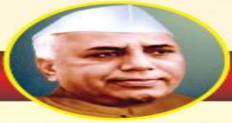
Hon. Yashwantrao Chavansaheb Founder